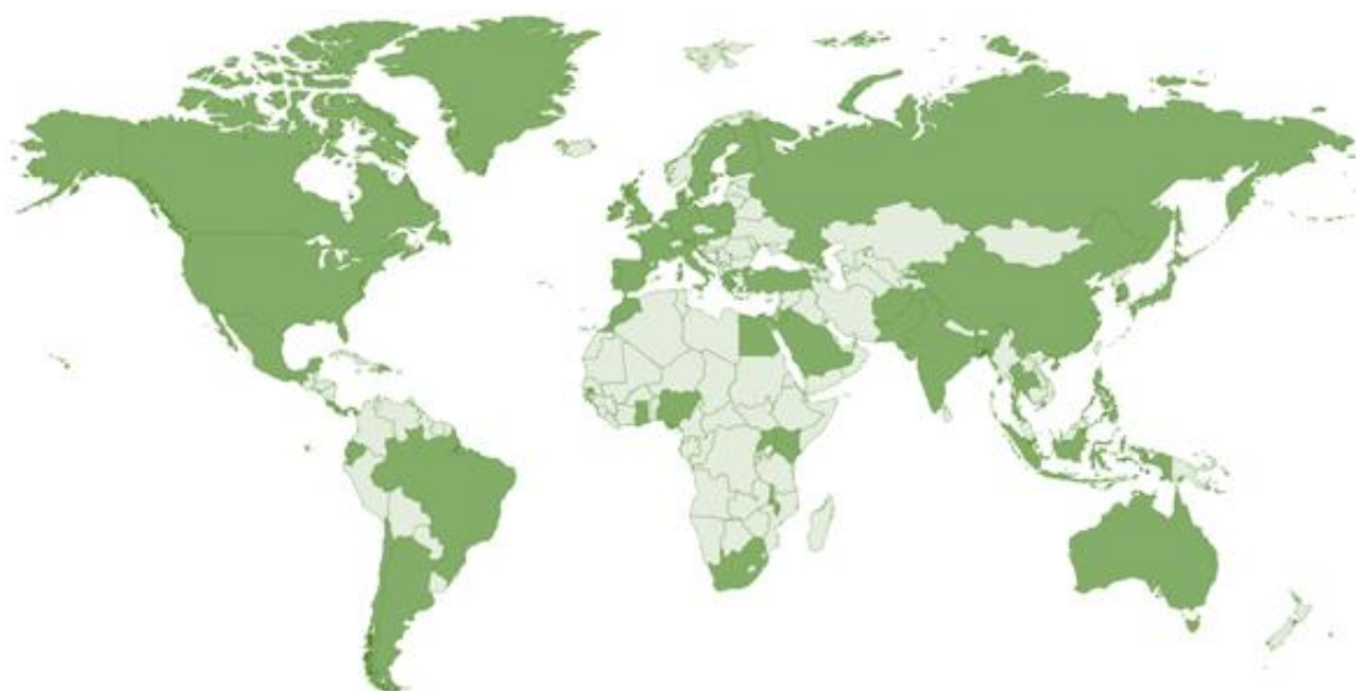
Figure A6.1: Geographic coverage of respondents by country of focus . Dark green indicates at least one respondent. Full responses only.